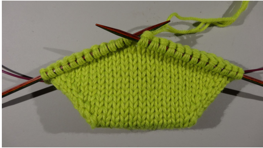
Stitches are separate even without plying the three strands