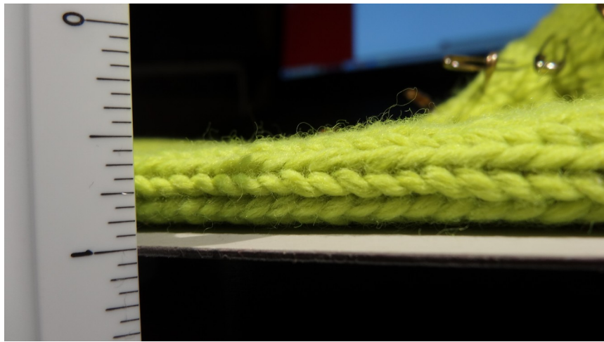
Trying to measure thickness